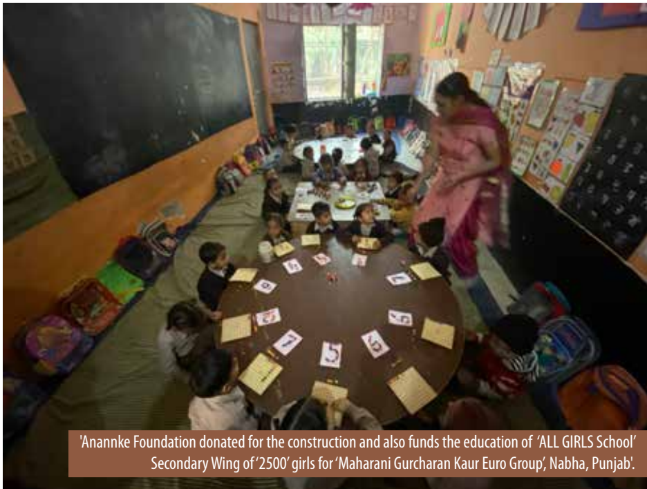
'Anannke Foundation donated for the construction and also funds the education of 'ALL GIRLS School' Secondary Wing of '2500' girls for 'Maharani Gurcharan Kaur Euro Group', Nabha, Punjab'.