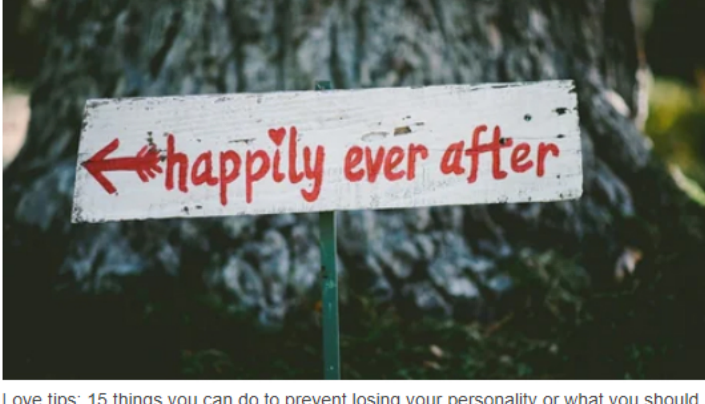
Love tips: 15 things you can do to prevent losing your personality or what you should never sacrifice for a relationship

Love can be like putting on a pair of magical glasses that alter your perception of the world. The honeymoon period is a real phenomenon but here are 15 things you can do to avoid losing yourself in a relationship or things you should never sacrifice for a relationship